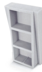
Suspension device LZ 1006