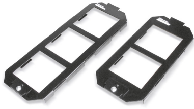
Floor box inserts for faceplates CSA Plus