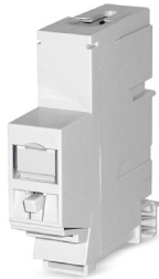
Rail adapter for 1 RJ45 module MS-K 1/8 or MS-K Plus 1/8

for 1 RJ45 module MS-K 1/8 or MS-K Plus 1/8