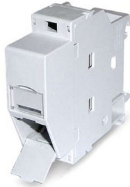
Rail adapter for 1 RJ45 module MS-C6A 1/8 Cat.6A (IEC) 180°-K (Keystone)