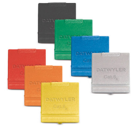
MS-K Plus 1/8 Cat. 6A RJ45 module, shielded, with dust shutter