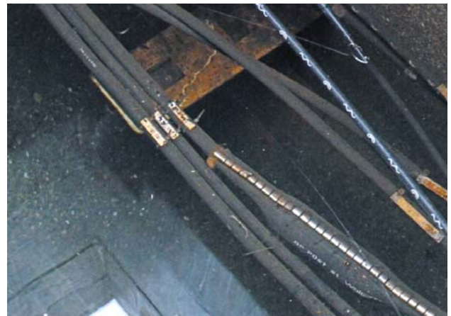
Extreme case: this cable duct is completely under water.

Standard G.652 was drawn up by the ITU. IEC/CENELEC incorporated these types of fibre as "OS1" and "OS2" in the standards for application-neutral, generic cabling, ISO/IEC 11801 and DIN EN 51073 – the attenuation values here being higher than in IEC and CENELEC (60793-2-50) documents referred to in this standard. The parameters of IEC 60793-2-50 are similar to those of standard ITU G.652.D.