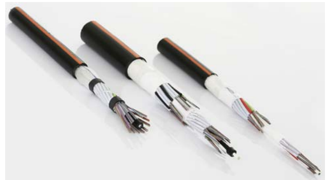
Datwyler's FO Outdoor cables are “virtually laterally watertight” due to the combination of HDPE sheath, swellable elements and gel-filled strands.

Following on from the question of whether universal cables are suitable for burying and installing in cable duct systems, it